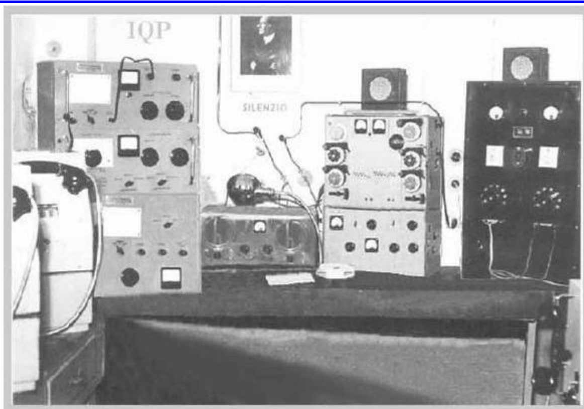
IQP - SAMBENEDETTORADIO - 1950