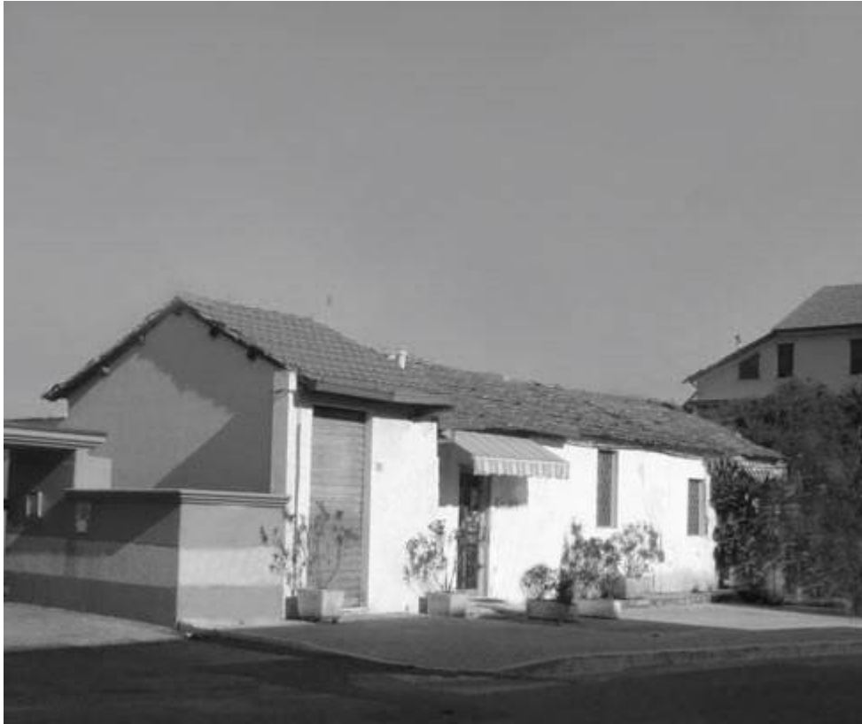
THE SMALL BRICK COTTAGE WHERE IQP SAMBENEDETTORADIO BORN IN 1945