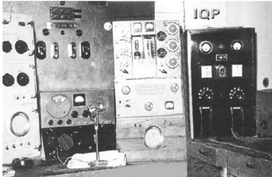
IQP - SAMBENEDETTORADIO - 1950