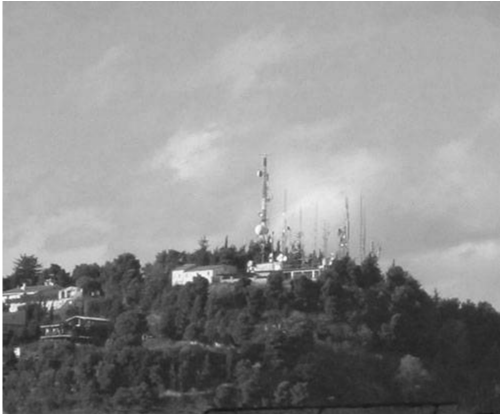
MONTSECCO AREA AND THE AERIALS IQP - SAN BENEDETTO RADIO

the small and romantic coastal radio station, built on the beach near the harbour, was transferred into a new building of the PP.TT. (Ministero delle Poste e delle Telecomunicazioni) located in the center of the city. Here the receiving and transmitting equipments were systemaized. I remember the enormous pylon on the stable summit and the long aerials on each quadrant. After some years the transmitter was set in Grottammare two km for from San Benedetto del Tronto, in the Montesecco area (on the top of a hill) about 150 mt. slm. IQP.