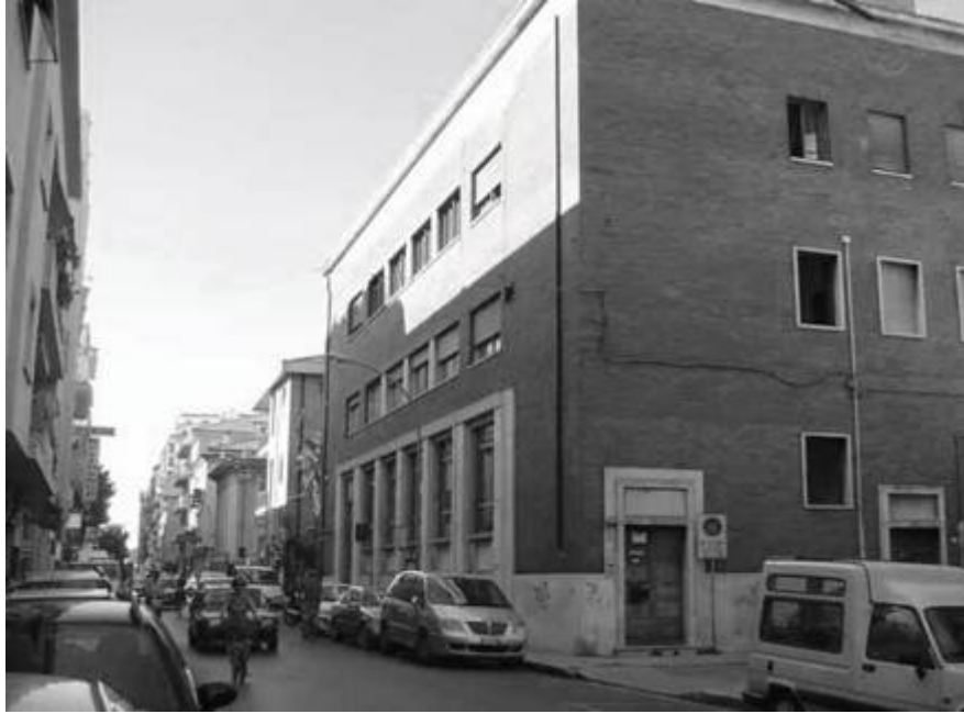
THE NEW BUILDING WHERE SAMBENEDETTORADIO - IQP WAS TRANSFERRED IN 1962 TO THE SECOND FLOOR