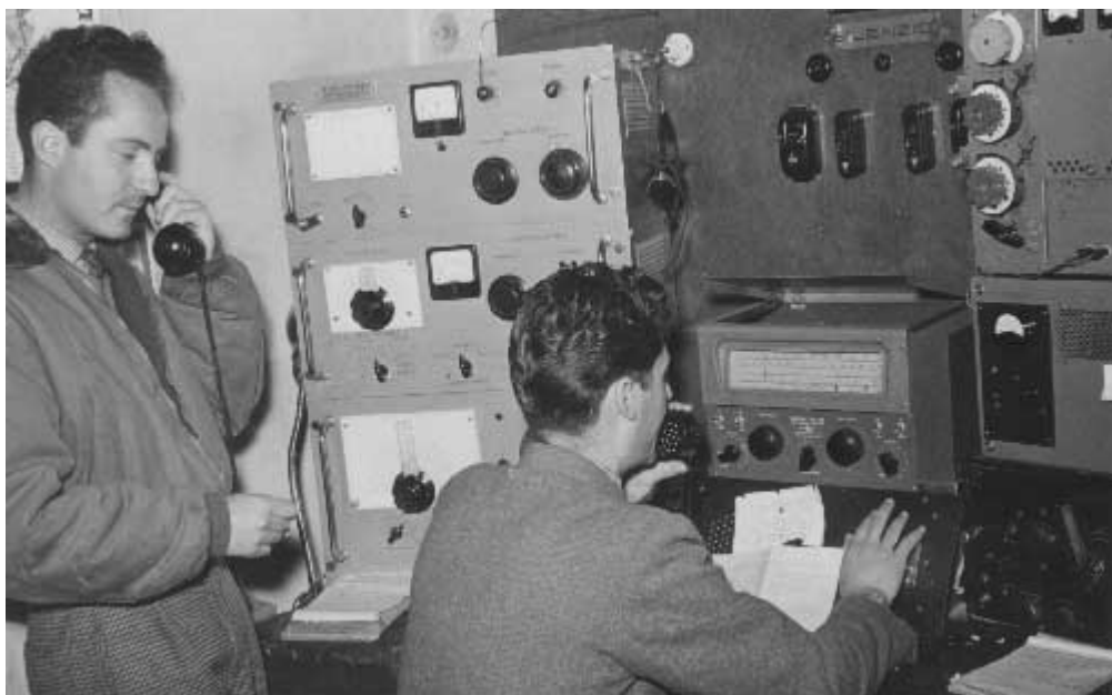
IQP - SAN BENEDETTO RADIO - 1958